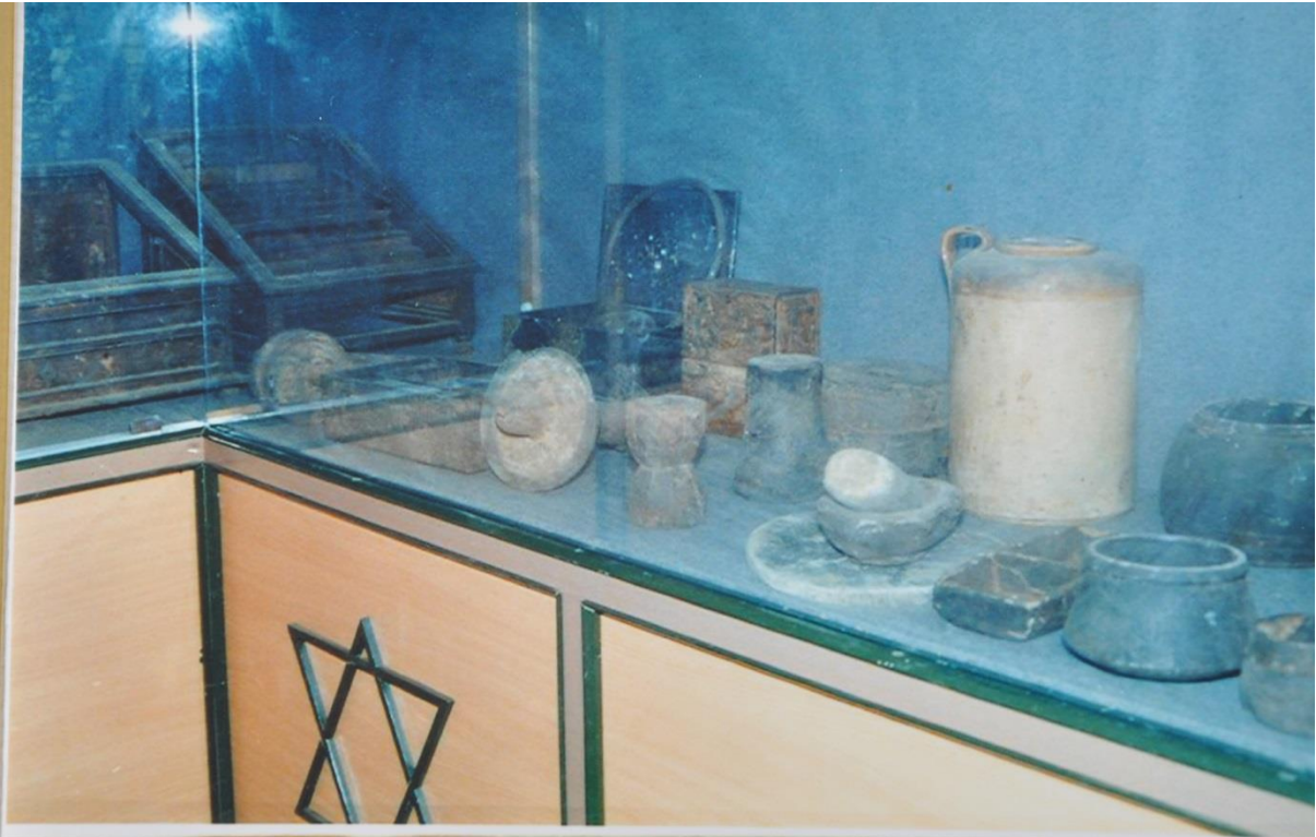
Ancestral stone and ceramic utensils