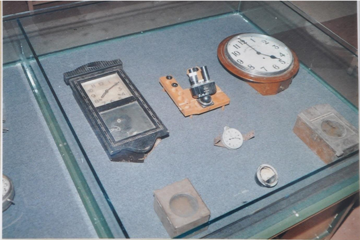
The mechanical time keepers out of time