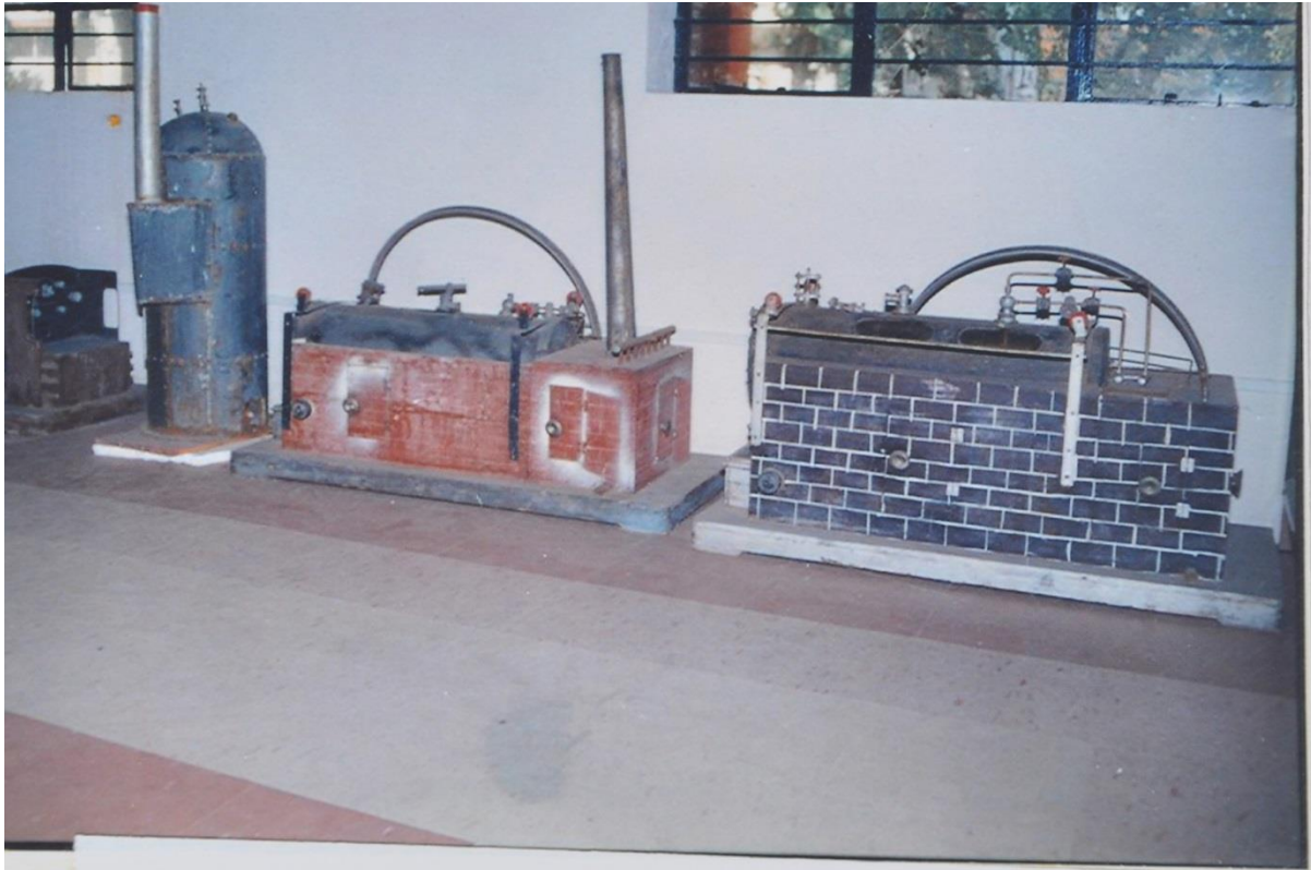
Trainees recreating the models of steaming glory