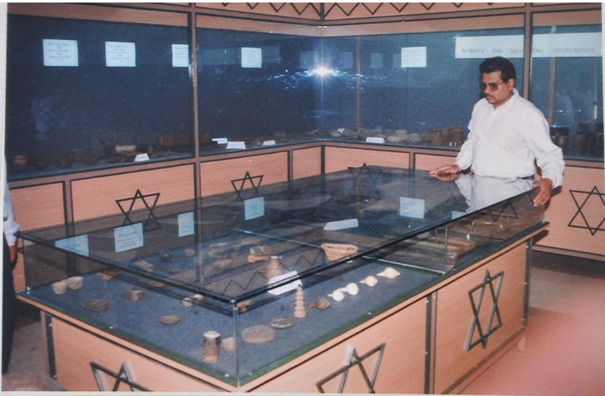
Palm writings and molluscan fossils in sash caisse