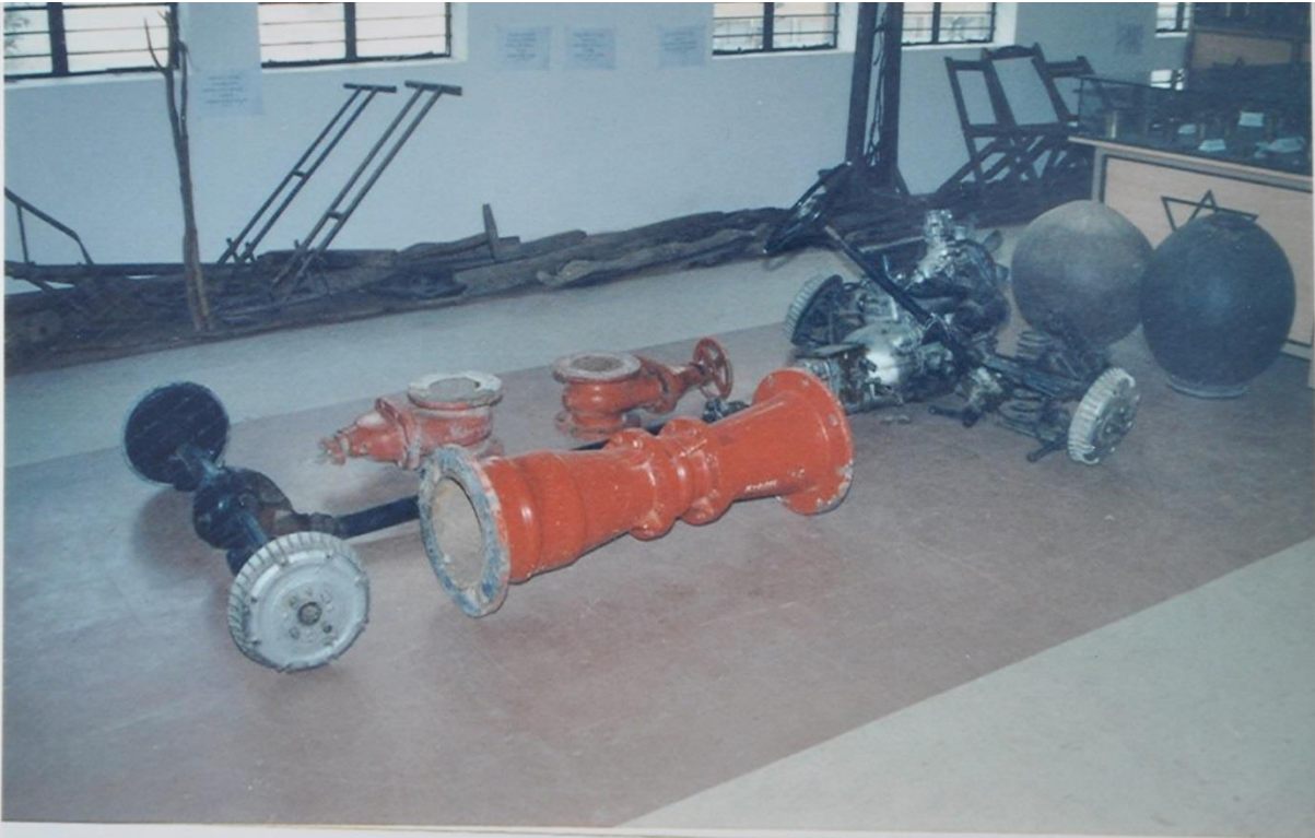
Venturi in the backdrop of agro implements