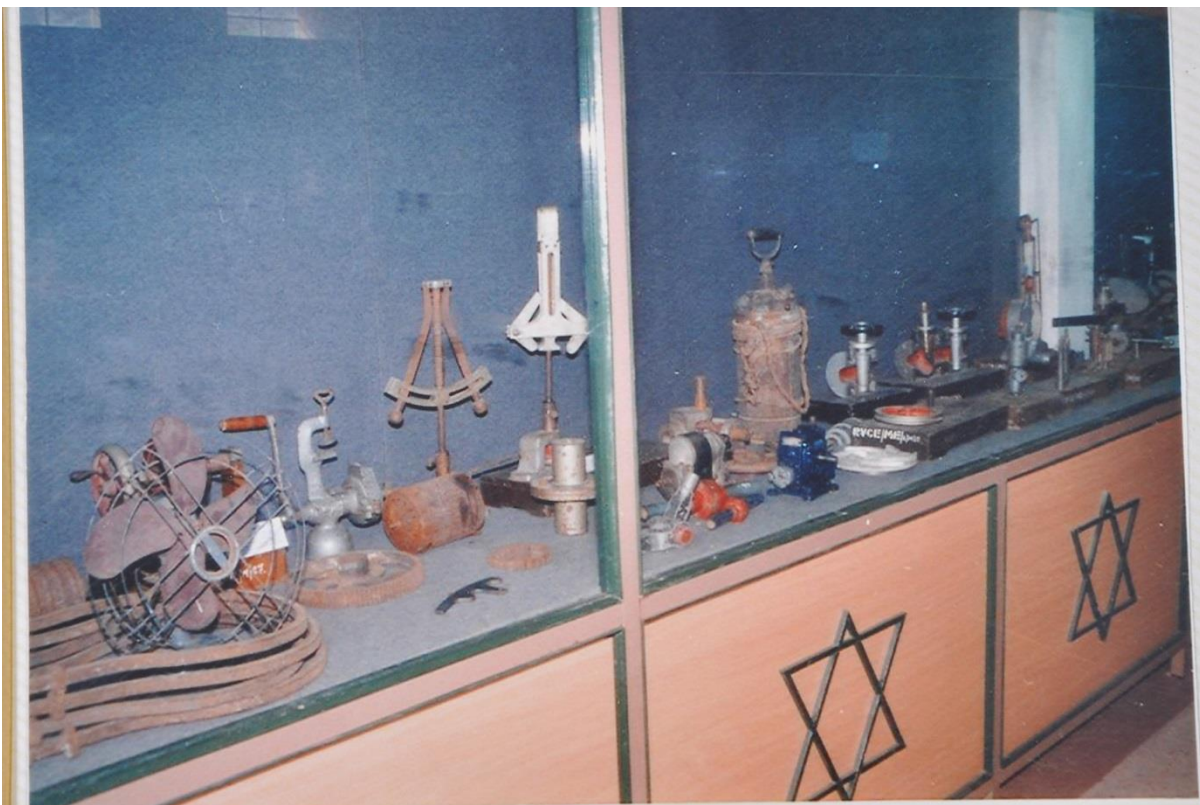
Rotary instruments rotating the wheels of time