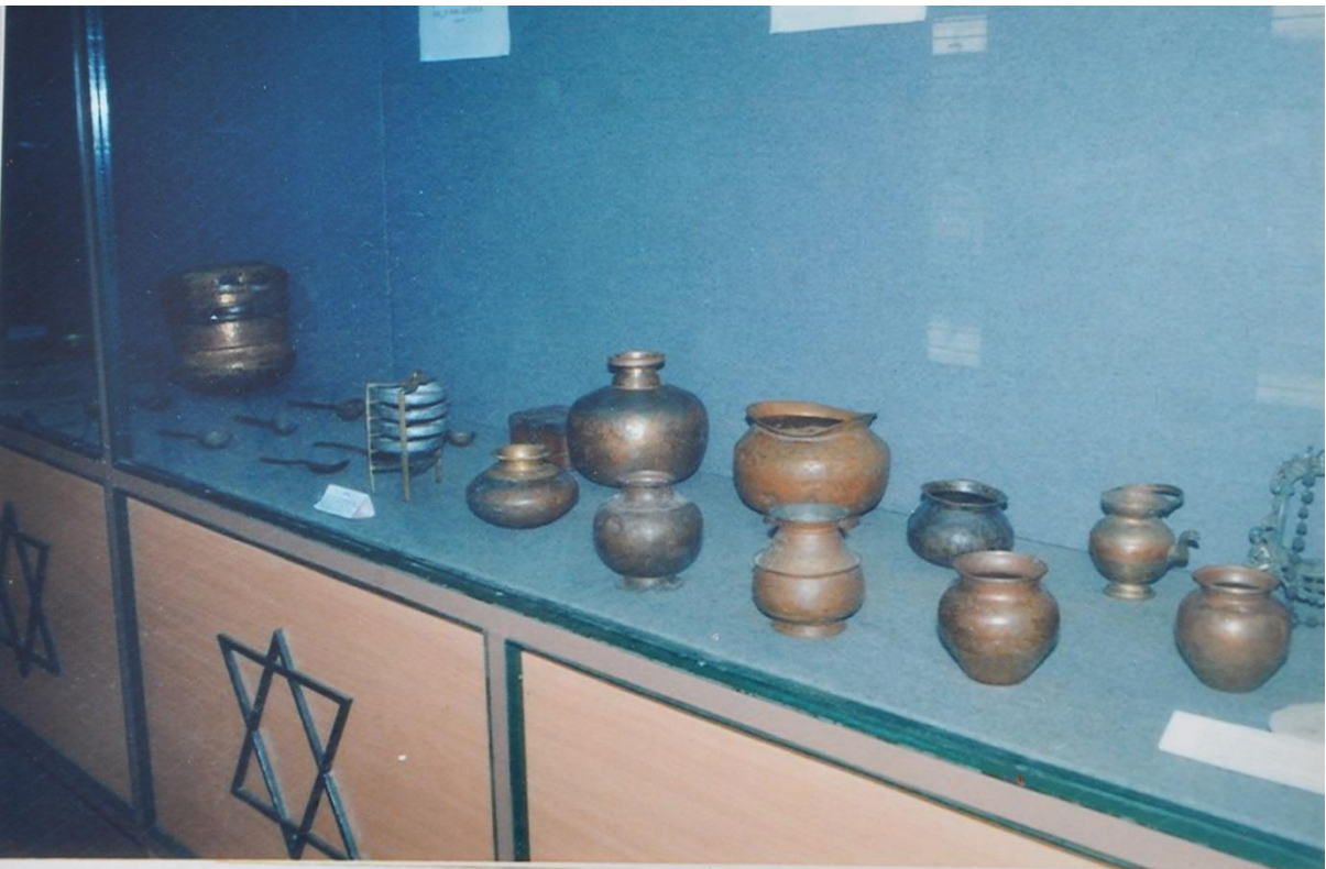
Culinary of the metallic age