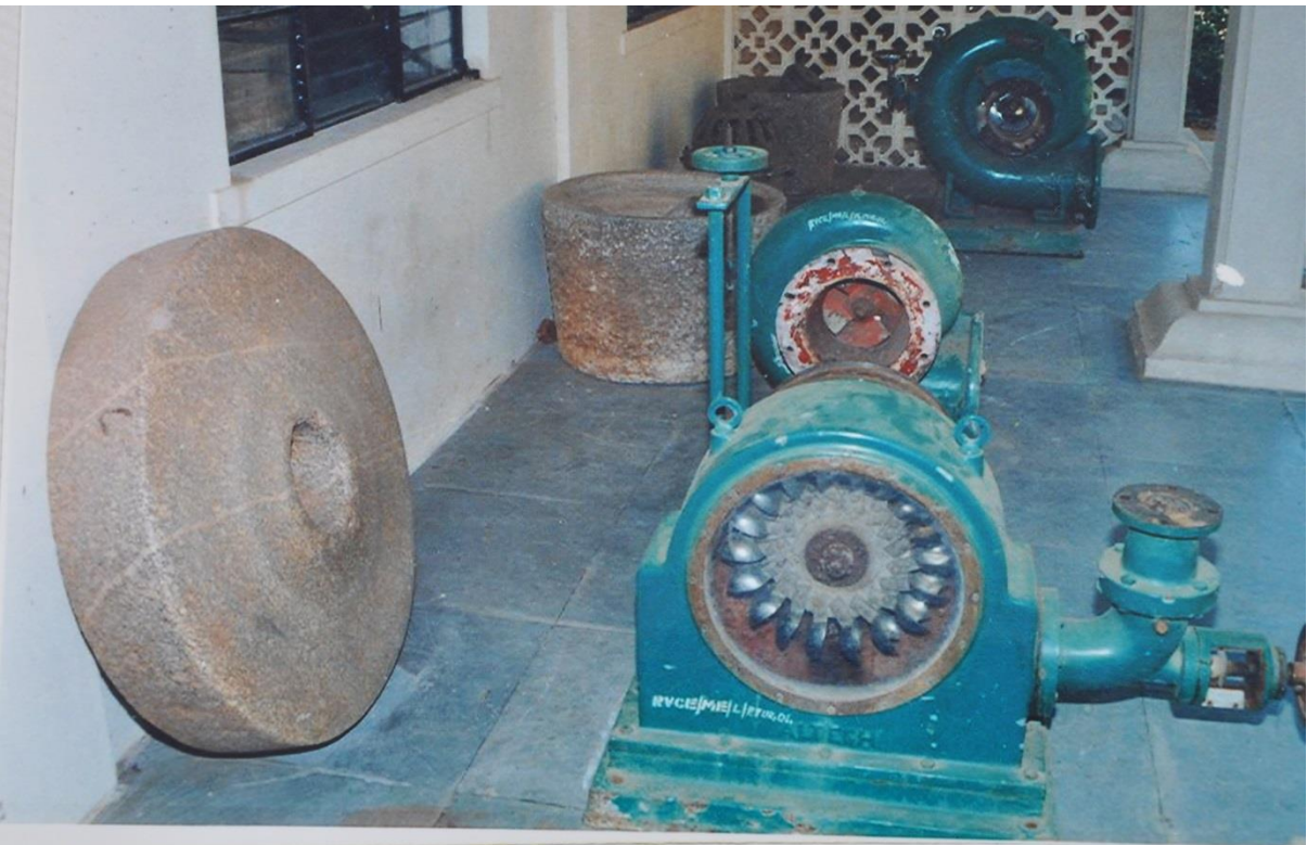
Pelton wheel proving the power of water