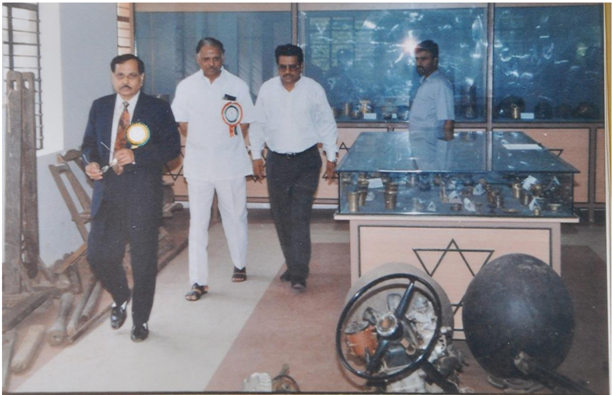
Mused minister in the museum