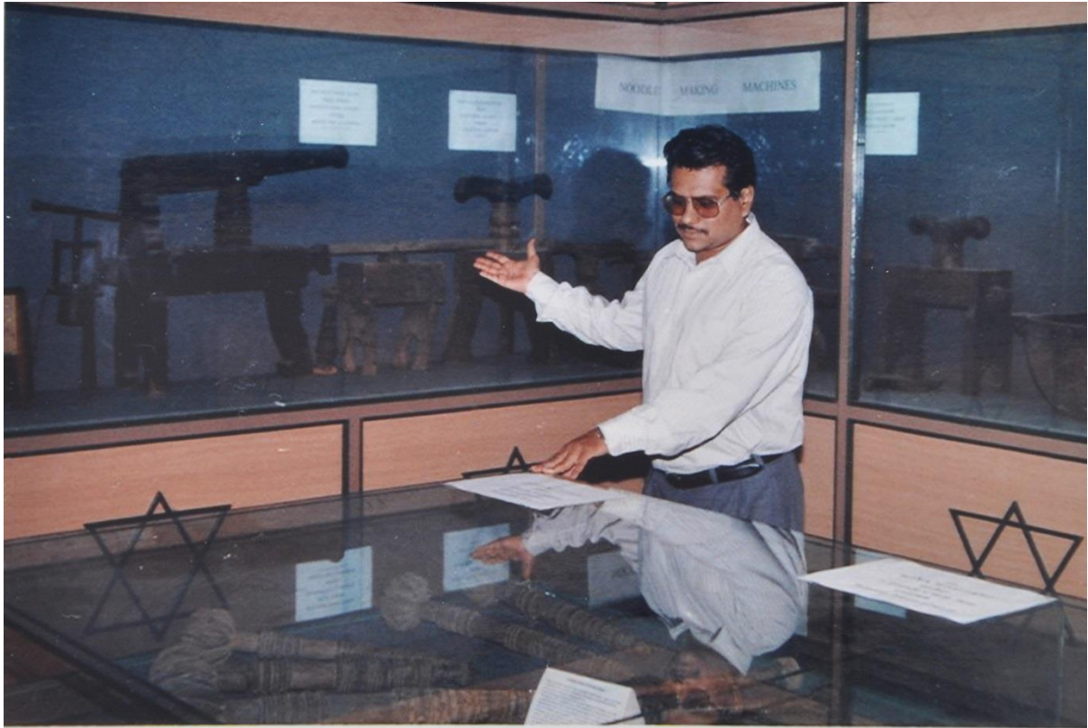
A screw jack noodle maker