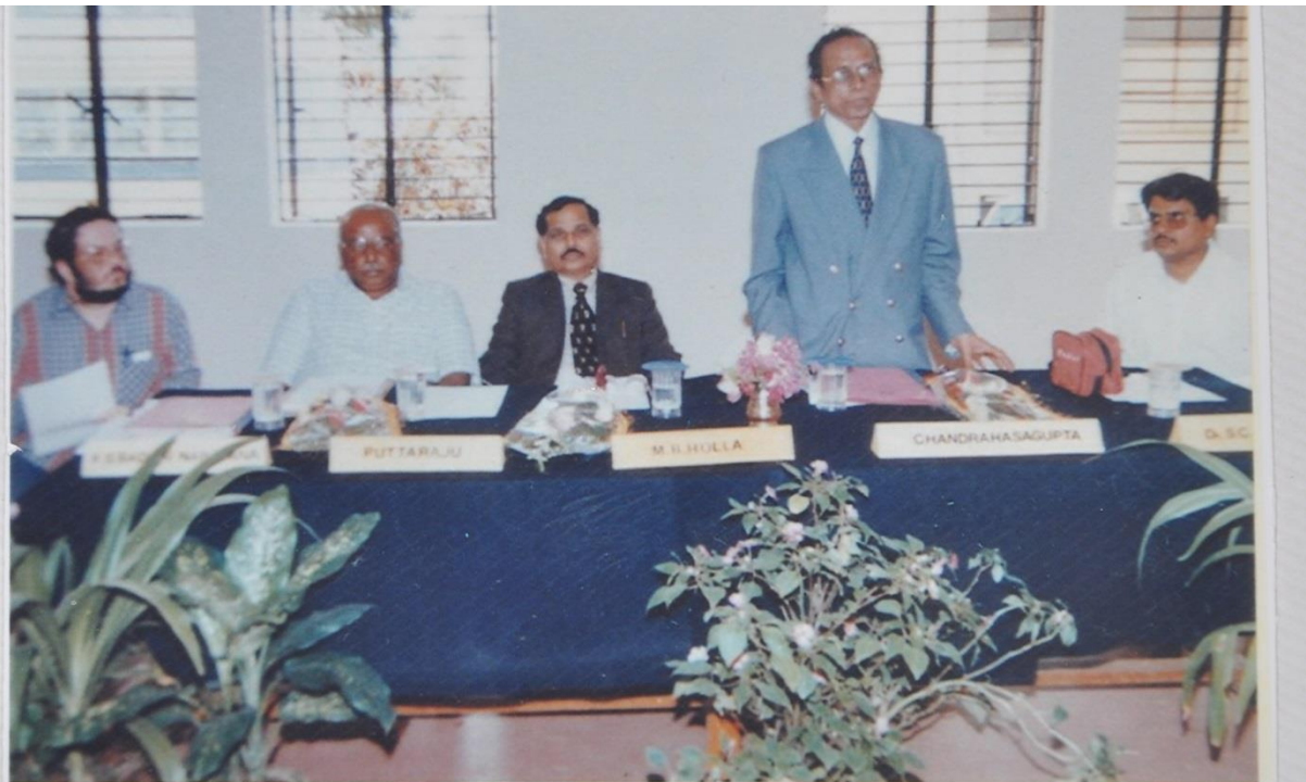
Secretary, dept. of Kannada & culture inaugurating the MUSEUM