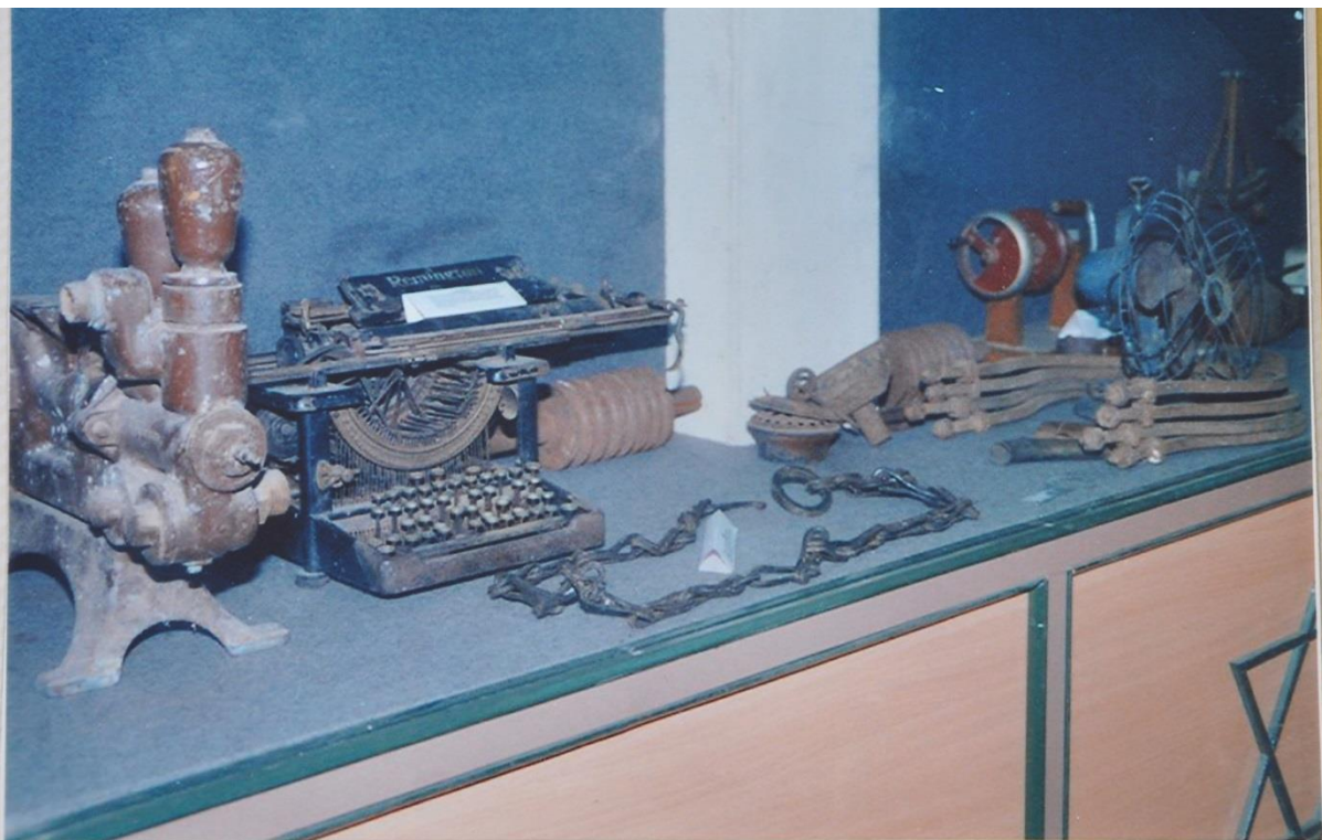
Remington reminiscing the previous millenium