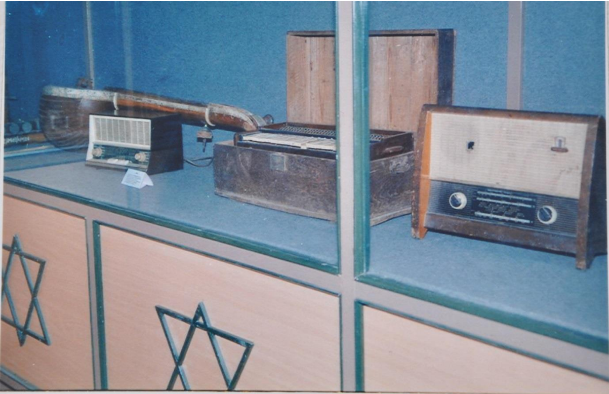
Stringed instrument with a marconian sets