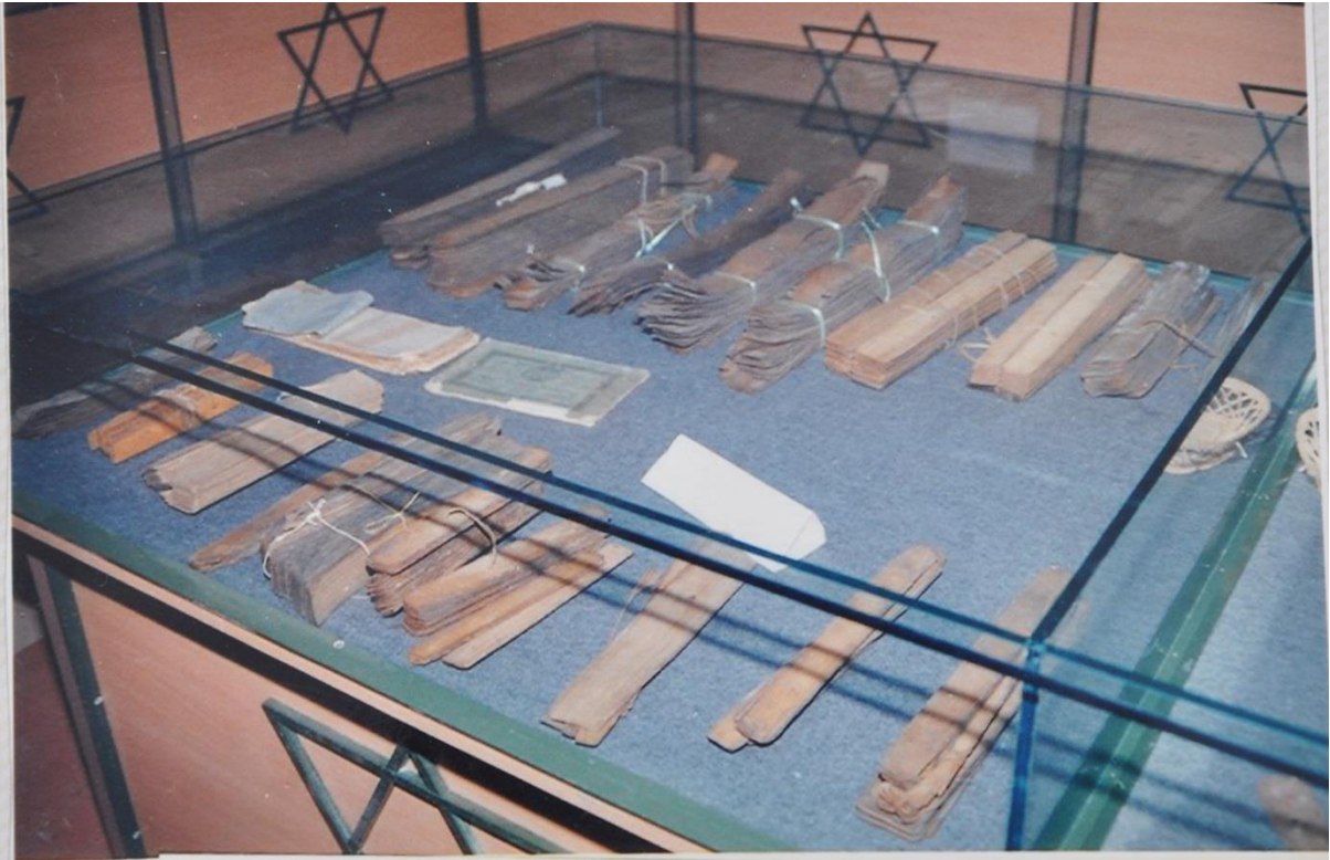
Vedic hymns on palm leaves